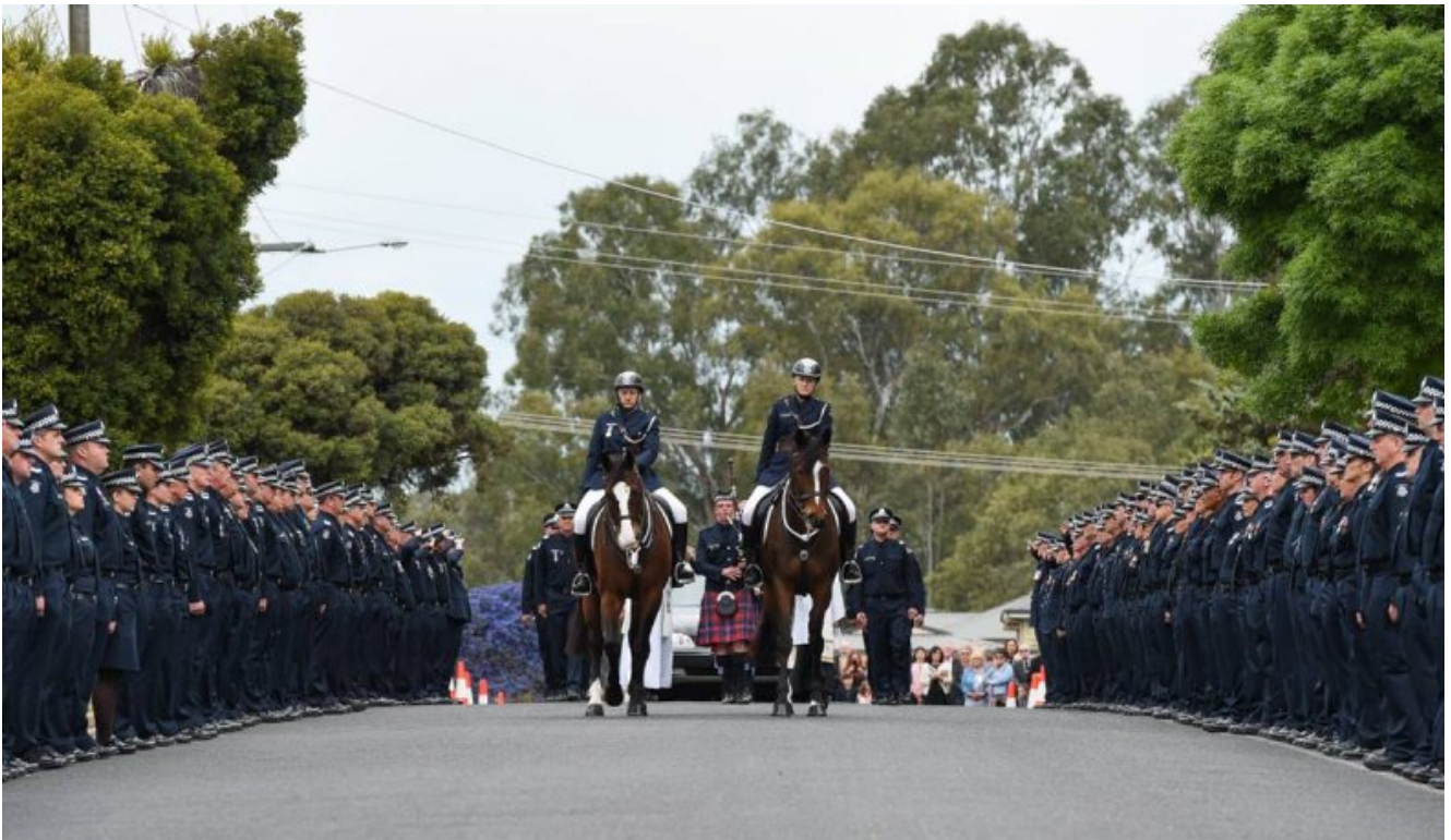
GUARD OF HONOUR: Wangaratta, Horsham and police command officers along White Street after Thursday's funeral.