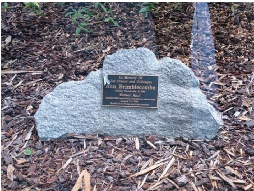
In memory of our friend and colleague Ann Brimblecombe Senior Constable 21795 `Senior Ann` Tragically killed performing road safety in active duty