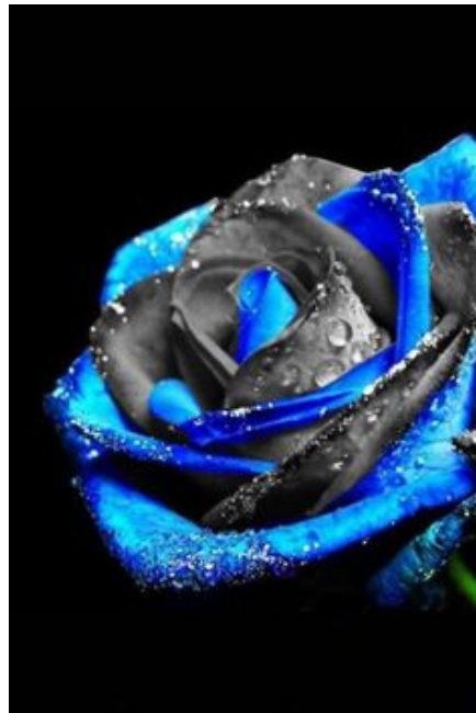
the Thin Blue Line Rose

Memorial 2 : Police Memorial Wall at the new Deniliquin police station, Charlotte St ( February 2018 )