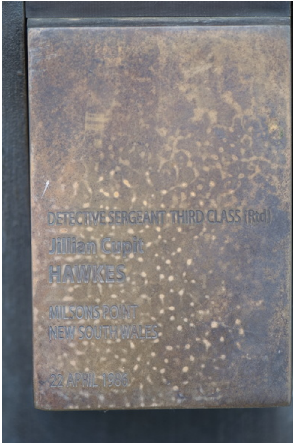
Touch Plate – National Police Wall of Remembrance, Canberra ( 2015 ) for Jillian HAWKES