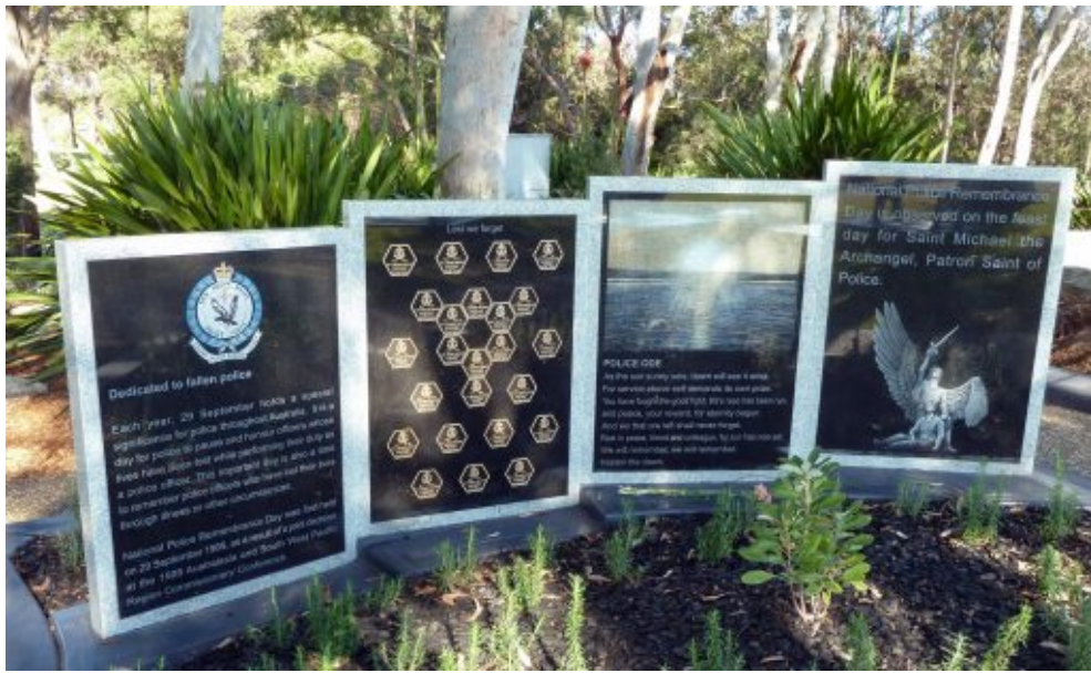
Woronora Cemetery, Linden St, Sutherland. Police Memorial Section