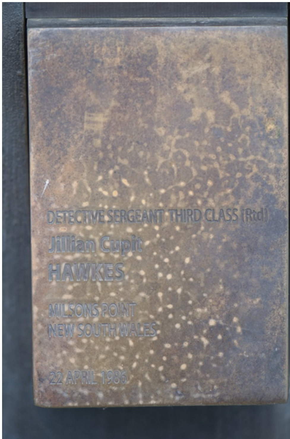
Touch Plate – National Police Wall of Remembrance, Canberra ( 2015 ) for Jillian HAWKES