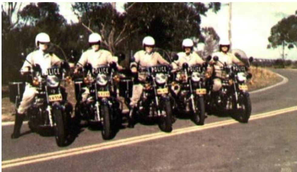
Early Police bikes