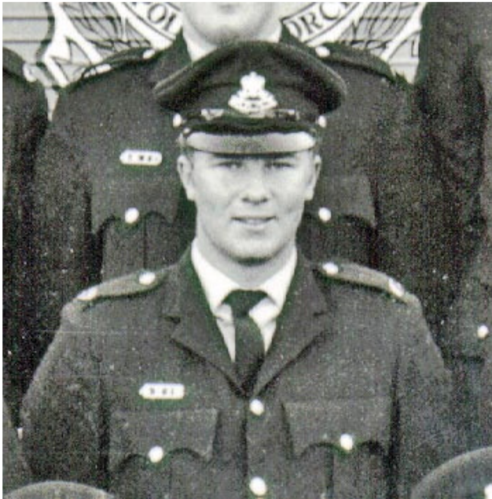
Class photo at Redfern Academy 1971 – 72