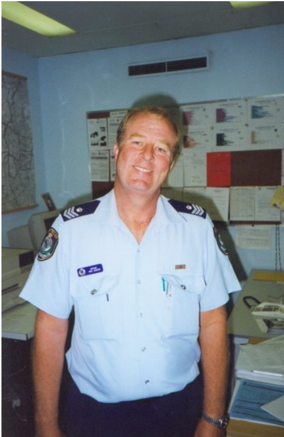
Flemington Police Stn c1998

Nothing further, than what is recorded above, is known about