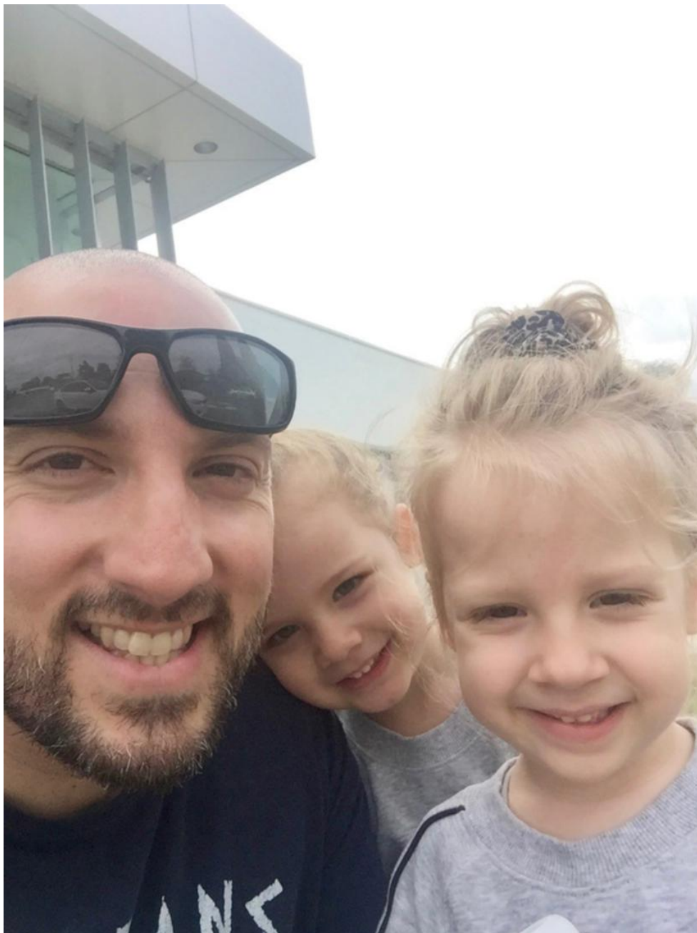
The father-of-two was survived by his two twin daughters.

According to an ABC report from January 2019, four Australian Federal Police officers died by suicide at their workplace between 2017 to 2019.