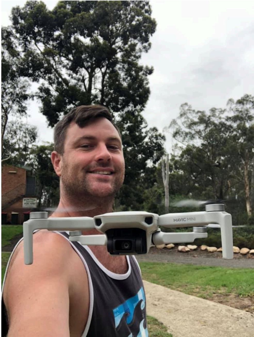
Culburra – 2020