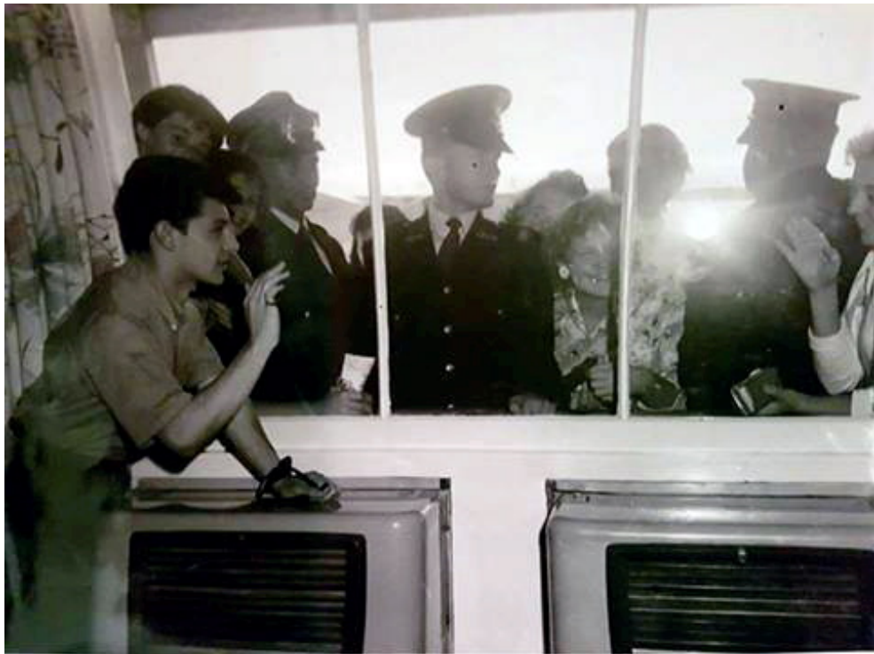
Dad and other Police at Mascot airport Protecting Frankie Avalon.