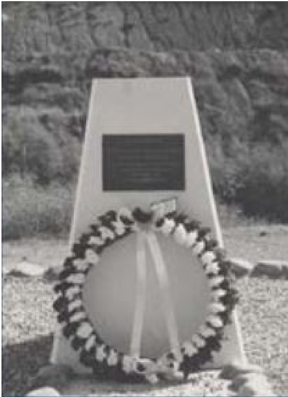
Memorial to Ian WARD – unveiled in 1985