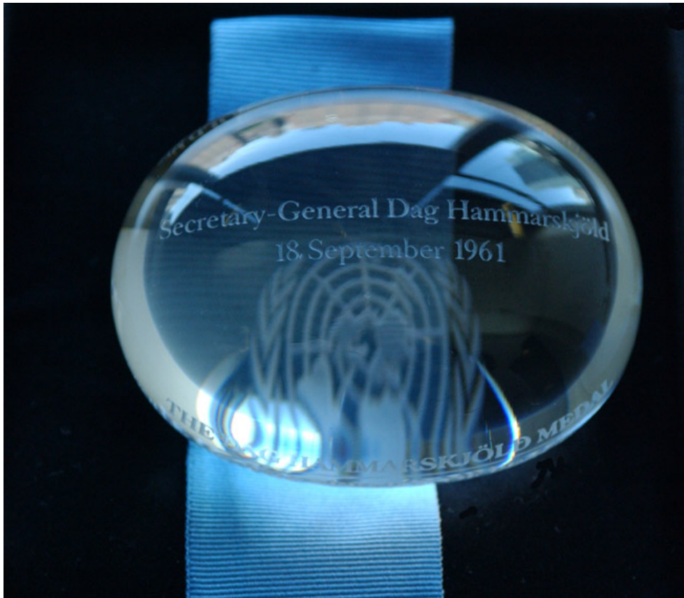
Dag Hammarskjöld Medal