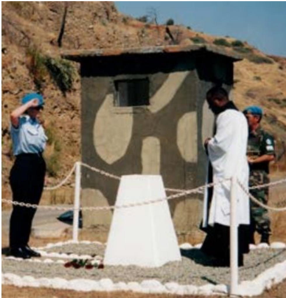
2003 Police Remembrance Day is marked with a ceremony at the cairn erected in memory of Sergeant Ian Ward.