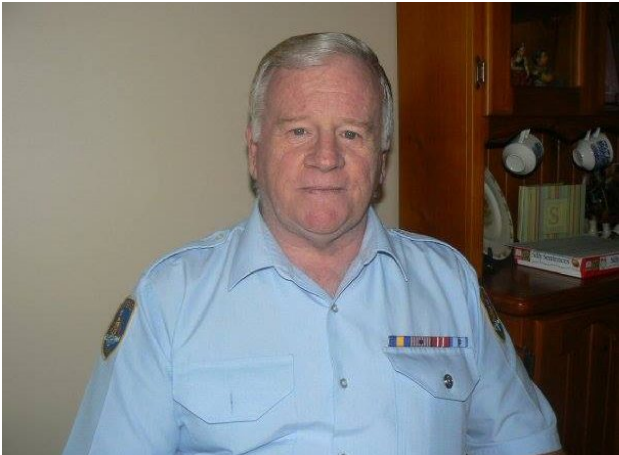
Working the Courts with Corrective Services NSW