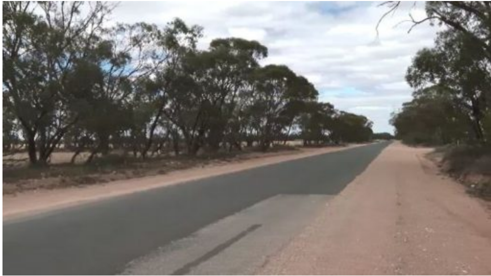
The site of the collision at Sea Lake. (Nine)