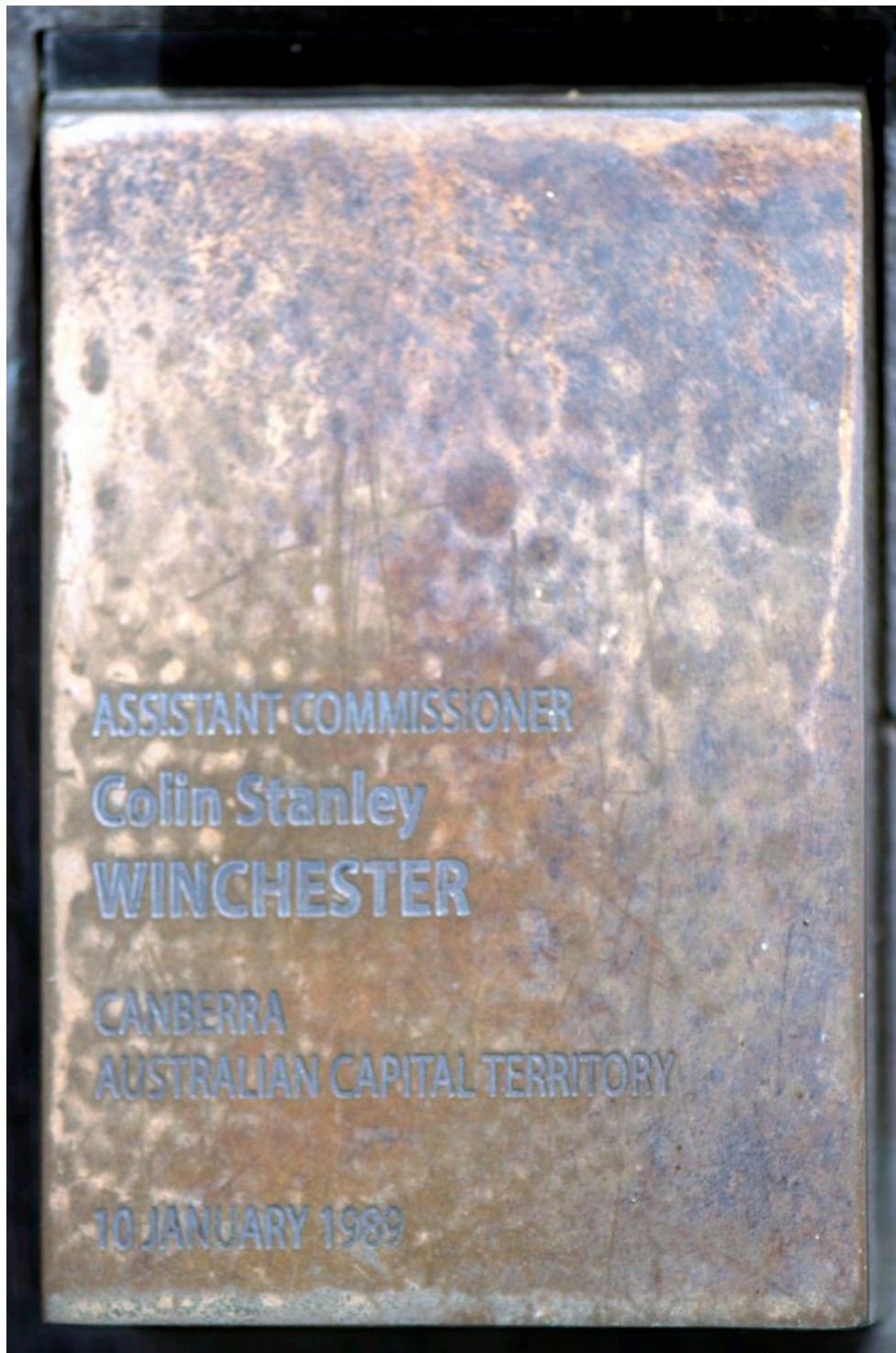
Touch plate at the National Police Wall of Remembrance, Canberra.

[alert_green]COLIN IS mentioned on the Police Wall of Remembrance[/alert_green]