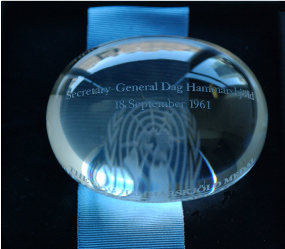
Dag Hammarskjöld Medal