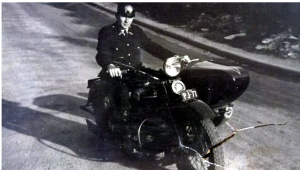
believed to be around 1949