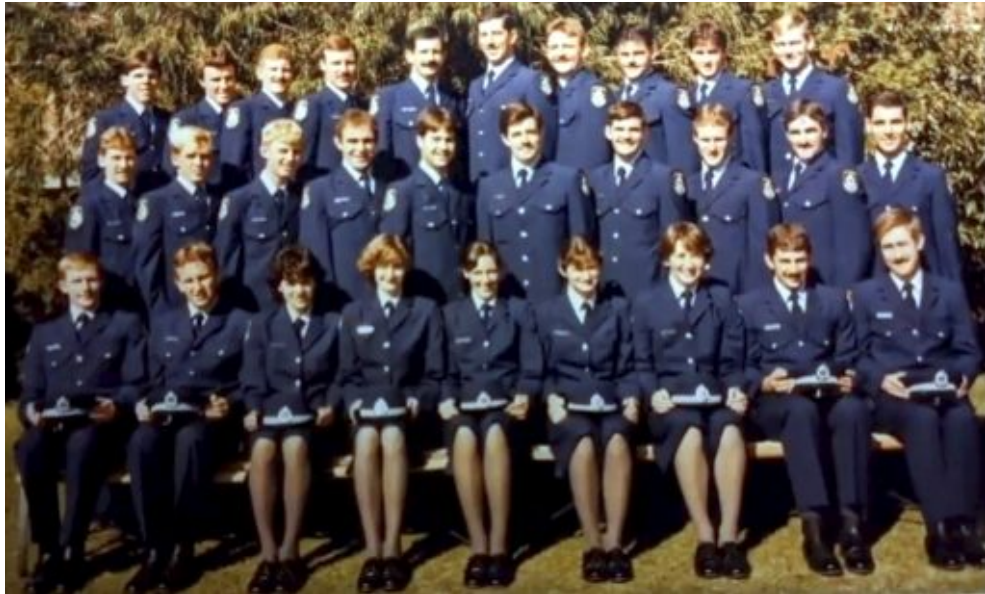
Class 194 A – May 1983