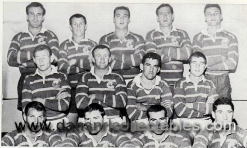
PARRAMATTA — FIRST GRADE, 1967