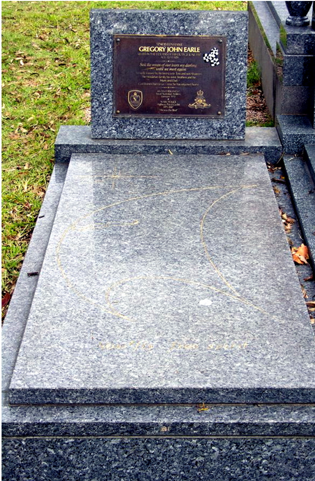
approximate location of grave: [codepeople-post-map]