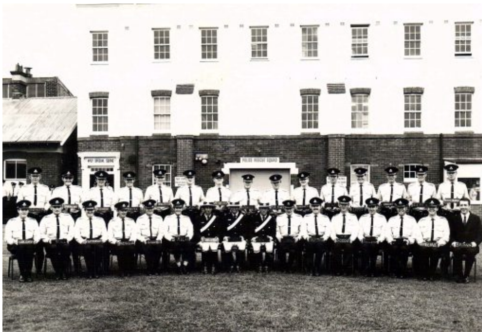
Class 127 at Redfern Police Academy – 1971

http://trove.nla.gov.au/newspaper/article/118299446