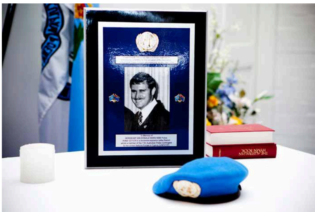
On 12 November, 1974 Constable Ward was serving with the