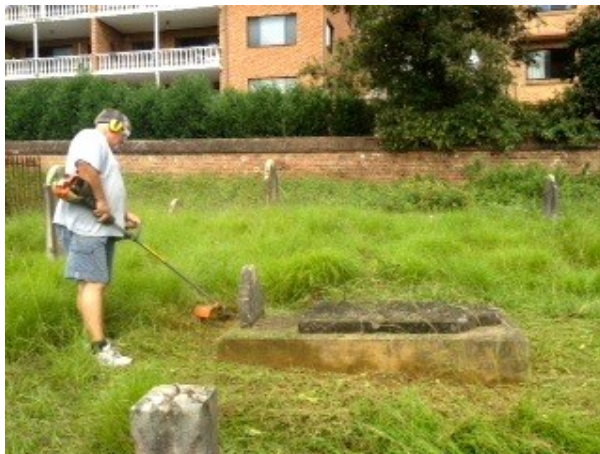
BENJAMIN RATTY's grave