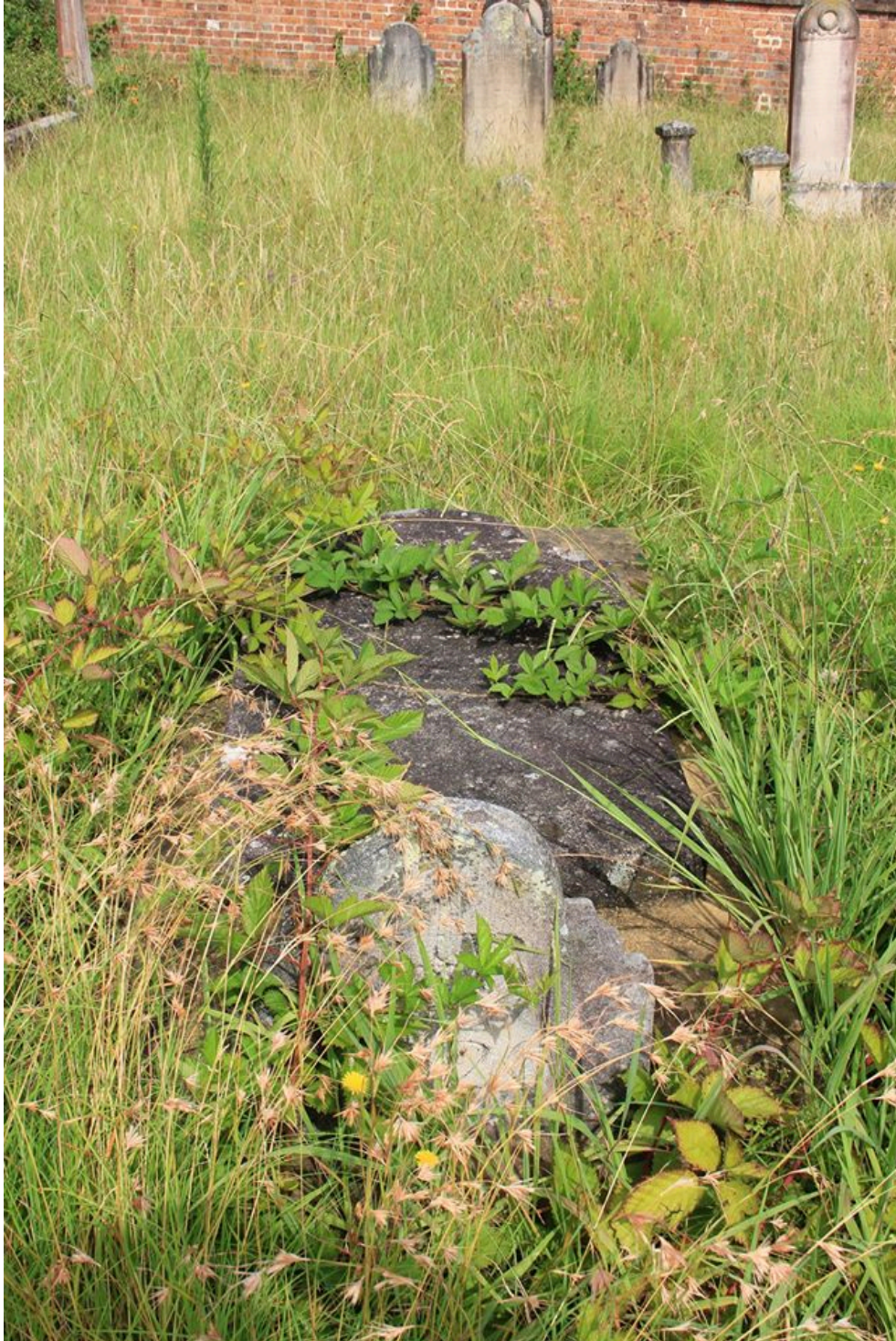
Benjamin RATTY the 3rd oldest known 'surviving' Police grave in NSW

Grave location: old St Johns Cemetery, Parramatta Portion 3