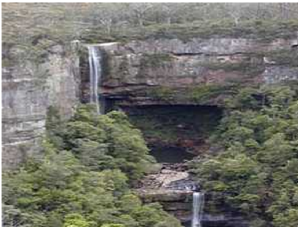
Belmore Falls – Robertson, NSW. 1500mt fall