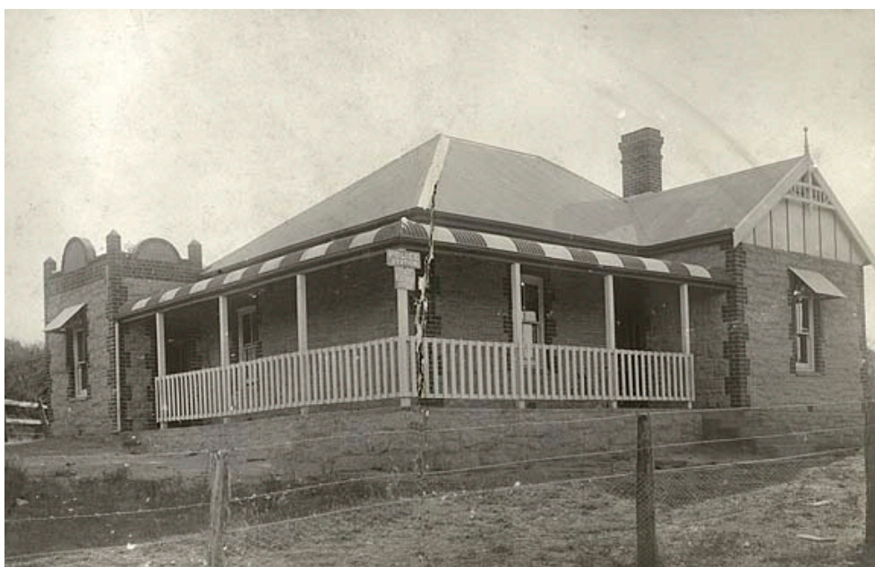
Rugby Police Station, NSW – No date

The earliest mention of Rugby Police Station ( which no longer exists as a Police Station ) in the National Library of Australia is 16 December 1875.