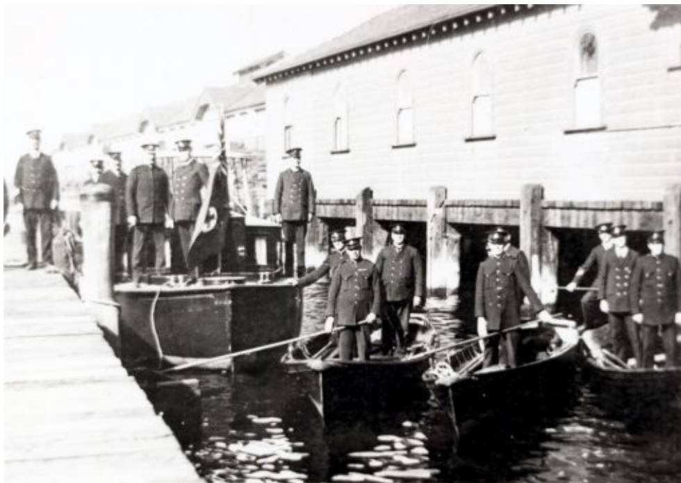
Sydney Water Police with the Cambria – 1930