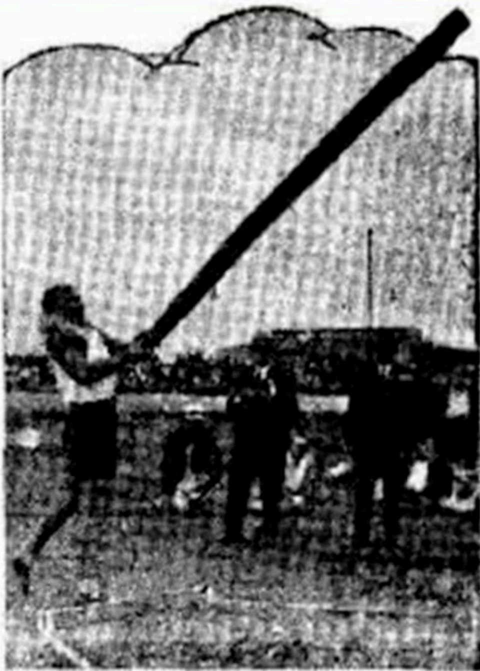
PENT UP ENERGY of E. E. Bezer about to be released in tossing the caber at the police sports.