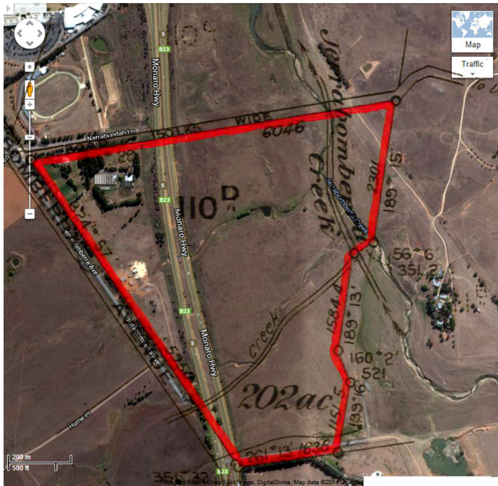
Google Maps image of area c2013 with Woden Block 110D boundary in red.