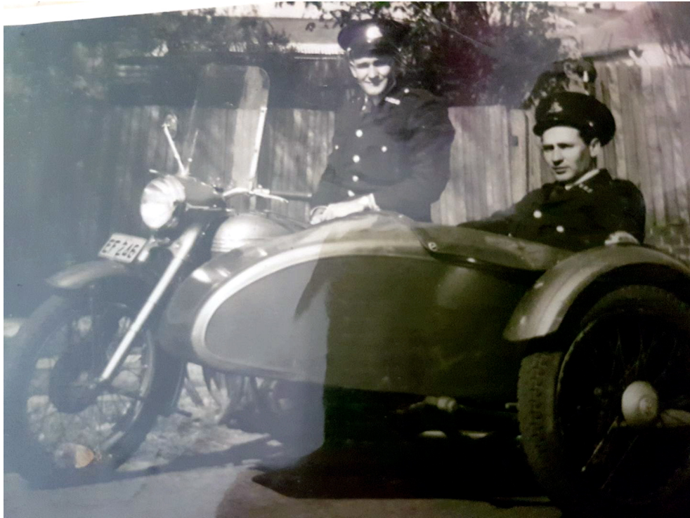
Dad in the side car . NSW Police Force