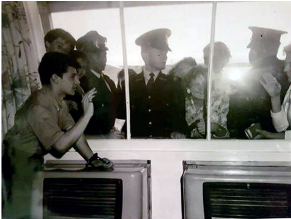
Dad and other Police at Mascot airport Protecting Frankie Avalon.