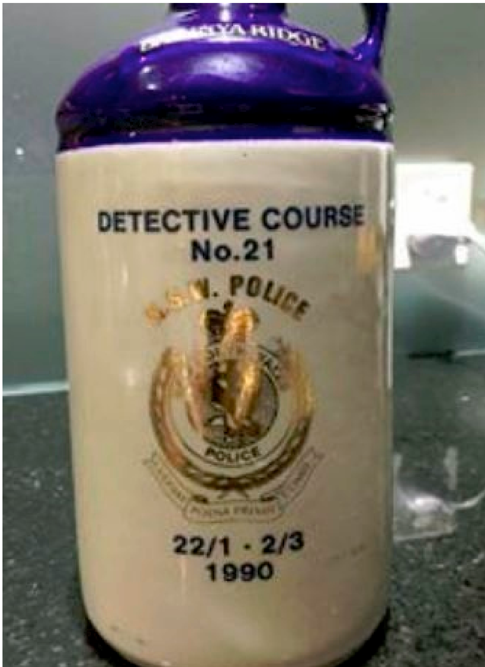
Detective Course # 21. 22 January 1990 – 2 March 1990