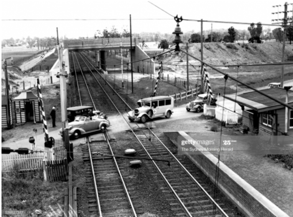
Warwick Farm Police Call Box – 29 November 1937