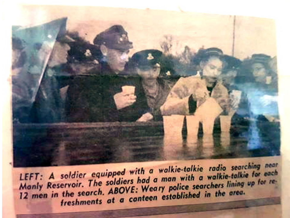
Weary Police searchers lining up for refreshments at a canteen established in the area.