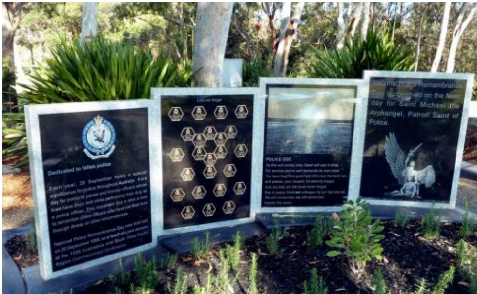
Police Memorial Section, Woronora Cemetery