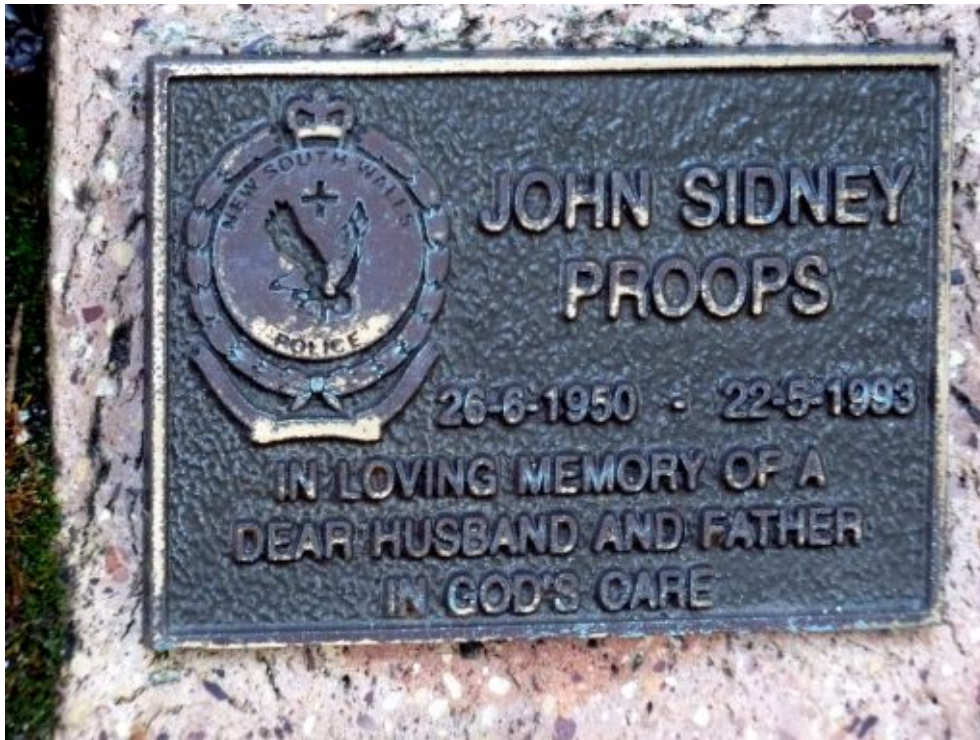
Henry Lawson Garden Walk E, # 12