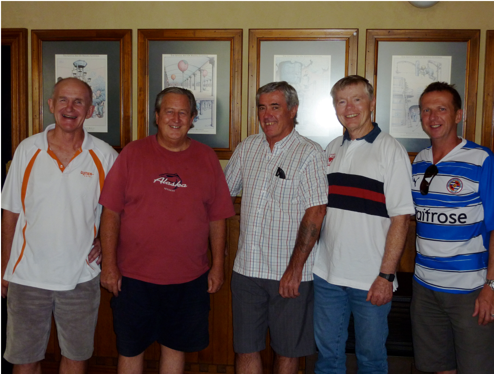
Photo taken at Dicey Riley's Hotel, Crown St, Wollongong, around 2001 of the old Wollongong Licencing Police who worked from Wollongong in the 1990's.