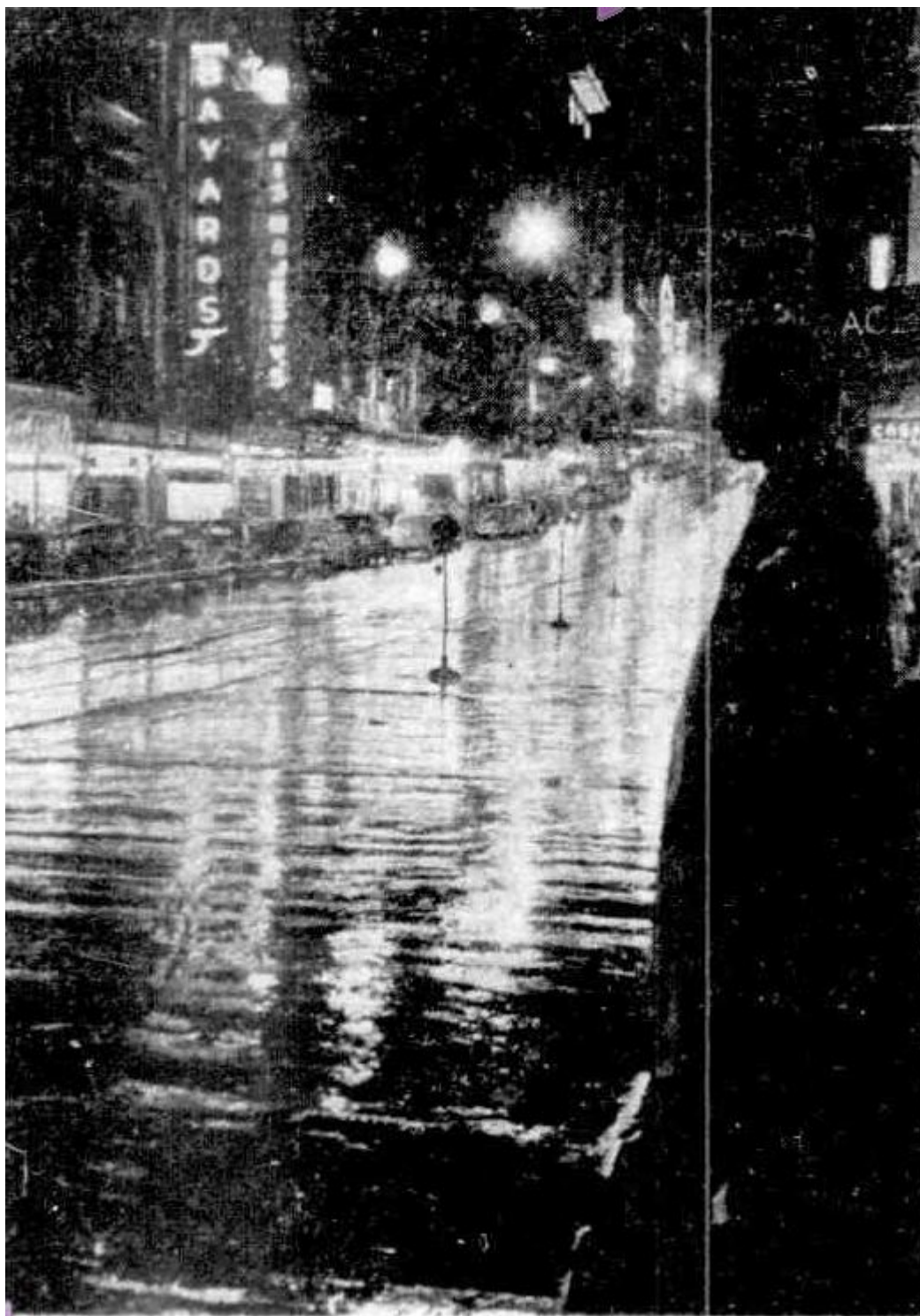
TIME: 10.30 p.m. Water runs across Queen Street, and lights glitter on the wet pavement. Rain had stopped the usual Saturday night bustle of the city; streets were almost deserted.